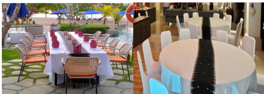
Figure 6. Table Decoration In Sudamala Hotel

Like other decoration in the lobby and hotel rooms, the decoration of the meeting room and restaurant also uses Manggarai or Flores cultural characteristics shows in Figure 6 and Figure 7 as follows.