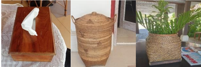
Figure 7. Rubbish Bin, Wooden Tissue Holder, & Flower Vase In Sudamala Hotel

in every area of the hotel such as the lobby, rooms, restaurant and meeting rooms, some of the equipment are Rubbish bin, Wooden tissue holder, and flower vase, which made from rattan by local people shows in Figure 7 as follows.