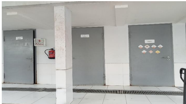
Figure 10. Temporary Shelter In Sudamala Hotel

Sudamala hotel has prepare mechanism in processing B3 waste of the hotel in aim to support the utilization of environmentally friendly products, which can be seen in Figure 3.9 as follows.