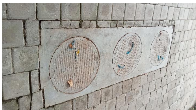
Figure 8. STP Tanks in Sudamala Hotel

Sudamala hotel has create a mechanism in processing liquid waste of the hotel in aim to support the utilization of environmentally friendly products. The proof of LWP shows in Figure 8 as follows.