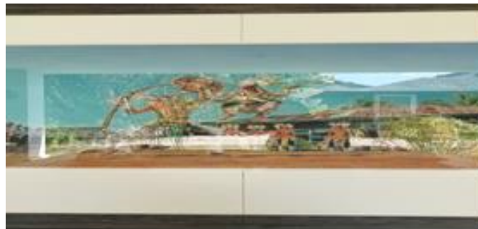
Figure 4. Painting of Caci Dance

Paintings as one of the interior decoration materials in the lobby also pay attention to local uses where the motifs of the paintings are motifs that picturize about the culture in the Manggarai area. One example is a caci dance painting in Figure 4 as follows.