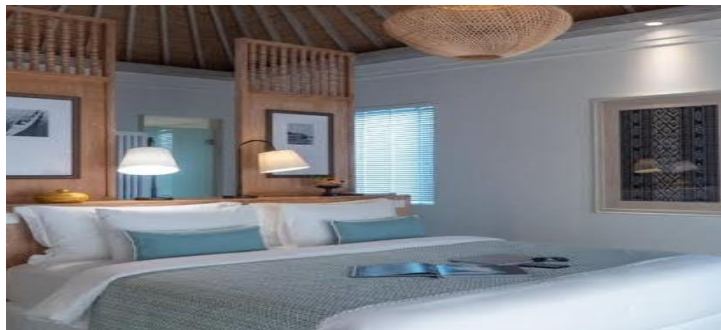
Figure 5. Bed Room in Sudamala Hotel

The rooms at the Sudamala Hotel are decorated using cultural characteristics of the Flores region, from the floors, room displays, to the fabrics used which have regional motifs. The rooms at the Sudamala Hotel are decorated using cultural characteristics of the Flores region, from the floors, room displays, to the fabrics used which have regional motifs. Hotel rooms are decorated using local uses where the ceramic motifs are motifs inspired by floral motifs. This motif is inspired by the floral motifs on songke woven fabric. Songke woven cloth is a handcrafted woven cloth from the Manggarai people, East Nusa Tenggara (NTT). Apart from ceramic decoration, there is also interior design in the room area, namely woven cloth motifs which are framed and then displayed on the walls of the hotel room area. This cloth is a woven motif cloth woven from Ende, East Nusa Tenggara (NTT) which is partly used to decorate the hotel room area. The rooms at the Sudamala Hotel can be seen in Figure 5 as follows.