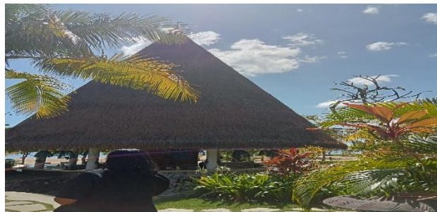
Figure 2. Design of Pool Bar

These local wisdoms include the shape of the roof of the Wae Rebo restaurant and pool bar which is inspired by the traditional building design of the Wae Rebo Village traditional house which has a conical shape. Design of the front of the lobby which uses Batu Compang, where the design is inspired by the design of Batu Compang in the Manggarai area. Design of front lobby can be seen on Figure 3 as follows.