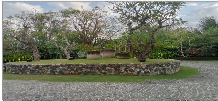
Figure 3. Design of Compang in Sudamala Komodo Hotel

The utilization of local products at the Sudamala Resort Komodo hotel is implemented in the form of decoration. Decoration is one way for hotels to recognize or promote products in a destination. Hotel Sudamala Resort Komodo is one of the five-star hotels in Labuan Bajo. This hotel tries to apply green product criteria, namely using local products such as local handicrafts to be used as decoration materials in every area of the hotel. Decorations in each area of the Sudamal Komodo Labuan Bajo hotel utilize local handicrafts and utilize motifs from local handicrafts such as woven fabric motifs and mat motifs to be used as decoration materials. These decorations are expressed in the form of cloth decoration paintings and ceramic floor decorations. These decorations are applied in every area of the hotel such as the lobby, Room, restaurant and meeting rooms.