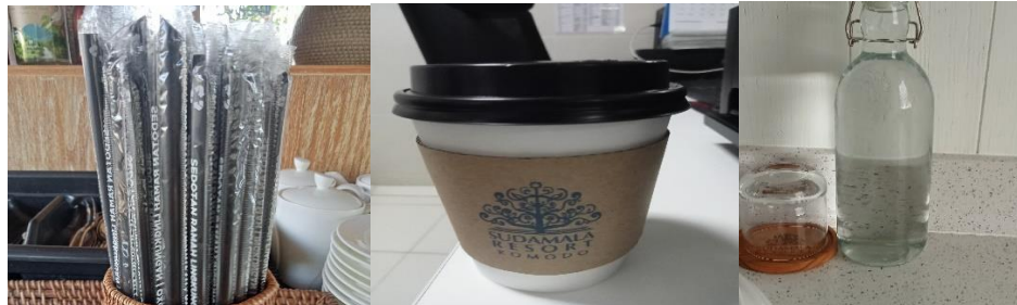
Figure 11. Utilization Drinking Straws, Drink Box & Water Refill In Sudamala Hotel

implementation of environmentally friendly products at Sudamala Hotel is illustrated in Figure 11.