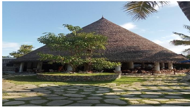
Figure 1. Wae Rebo Restaurant

The use of local products implemented in Sudamala Resort Komodo using of local products from the East Nusa Tenggara (NTT) region. Sudamala Resort Komodo, implements the green product through design of building, decoration, food, and operational equipment. The building design implemented at the Sudamala Resort Komodo hotel tries to highlight local wisdom which is expressed in the form of building design which can be seen in Figure 1 and Figure 2 as follows.